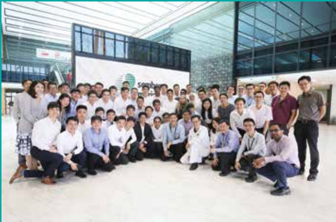
Students attending our INSIGHT Programme in August 2019

To spur interest in the offshore and marine industry among secondary and tertiary students from around the world, Sembcorp Marine initiated the INSIGHT Programme in 2018. This programme aims to enhance the students' understanding of industry practices and operational processes through site visits at Sembcorp Marine's yards and projects.