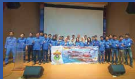
Batam yard colleagues conducting sharing session at Hasanuddin University

Batam yard conducted a sharing session on welding science and industry applications for 22 students at Hasanuddin University in South Sulawesi in July 2019.