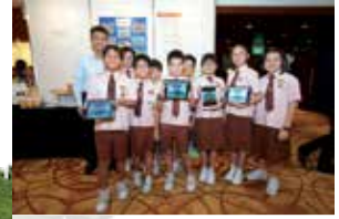
Students from Temasek Primary School at the Green Wave awards ceremony