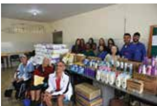
EJA raised funds for some 2,000 beneficiaries