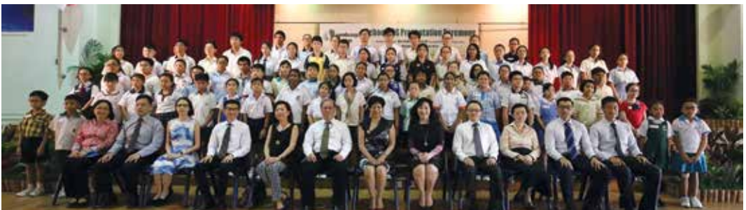
Recipients of SchoolBAG 2019

A 43 -member contingent from Sembcorp Marine participated in the National Day Parade 2019