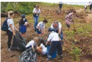
Employees from EJA and students participating in the Nossa Praia project