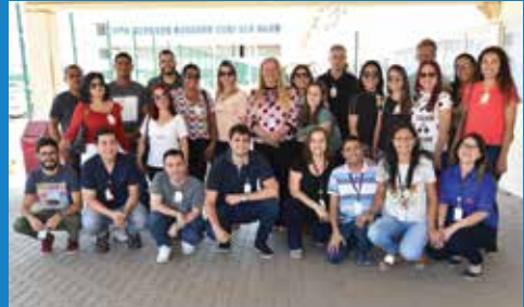
Participants of the 7 th Technology Transfer Programme in Singapore

Conducted in collaboration with Sembcorp Marine, Singapore's Ngee Ann Polytechnic and the Federal Institute of Espirito Santo (IFES), the Joint Educational Programme was set up in 2013 to train promising engineering graduates from Brazil for suitable positions in EJA. The 7 th batch of trainees (nine in total) commenced their one-year programme in Singapore in January 2019. The programme included an intensive three-month Technical English Course in Mechanical Engineering (TECME), followed by a Diploma (Conversion) in Marine & Offshore Technology (DCMOT) at Ngee Ann Polytechnic and on-the-job-training at Sembcorp Marine shipyards. A total of 128 trainees from EJA and IFES have thus far completed the Joint Educational Programme.