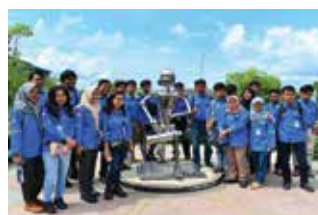
Batam yard colleagues conducting a sharing session at Hasanuddin University, South Sulawesi