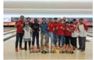
Sembcorp Marine participants at the ASMI Bowling Tournament