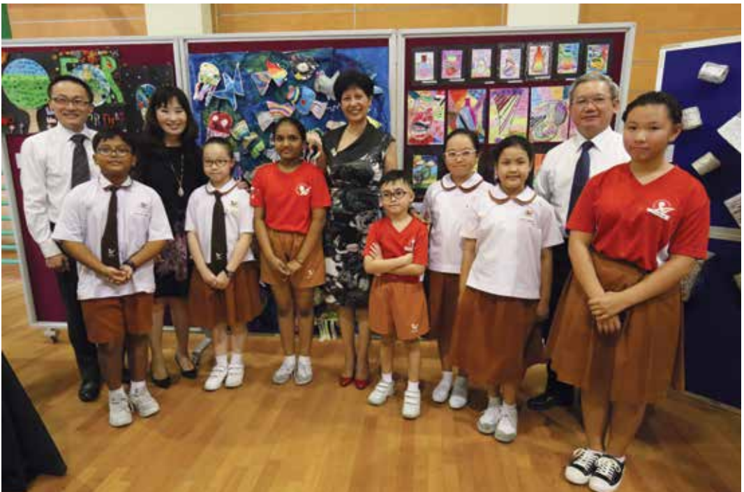
As part of our commitment to giving back to the community, we have awarded over $4.4 million of bursaries to more than 22,000 students since 2001, through our long-standing School Book Assistance Grant (SchoolBAG).

Beyond Singapore, the Group's overseas yards organise programmes that advance local training and capability building, environmental sustainability, youth and educational development, as well as sports and cultural promotion.