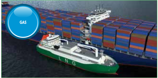
The unique membrane tanks of the 12,000 cbm Liquefied Natural Gas (LNG) bunker vessel, constructed for our customer MOL, will be fabricated under a licensing agreement with LNG containment specialist GTT. This project strengthens our track record in LNG-related engineering designs and solutions.

In 2018, Sembcorp Marine won a contract from Ørsted to build two topsides (right) for the Hornsea 2 Offshore Wind Farm in the UK North Sea.