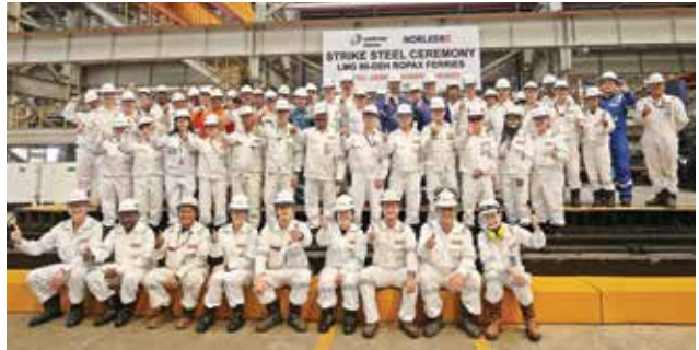
Project management teams at the Norled Battery-powered ROPAX Ferries Strike-steel Ceremony, which took place in July 2019 at Tuas Boulevard Yard. This project marks our entry into the ROPAX ferry design and construction segment.