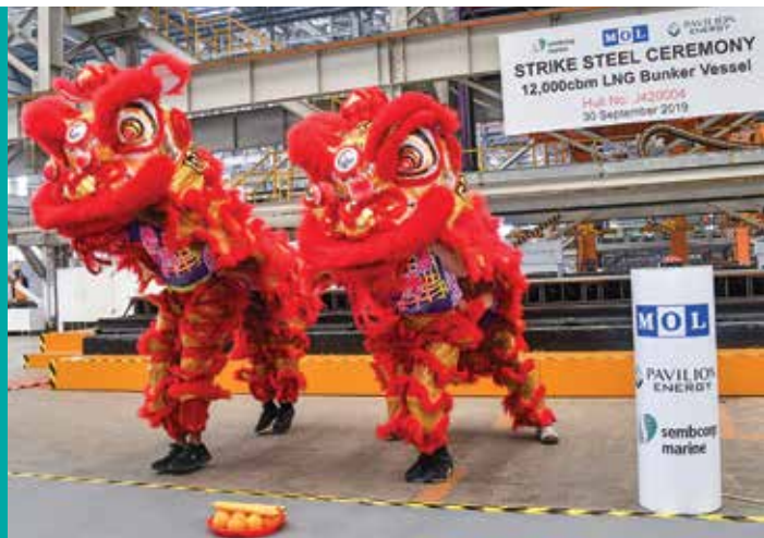
MOL LNG Bunker Vessel Strike-steel Ceremony

- Extracted from Chairman and CEO's Joint Report in Sembcorp Marine Annual Report 2019