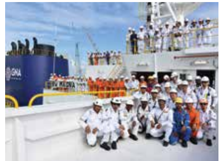
We completed upgrading works on the 173,400 cbm Floating Storage & Regasification Unit (FSRU) BW Magna for BW LNG Pte Ltd in December 2019.