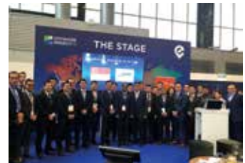
Sembcorp Marine attended the Offshore Energy Week 2019 in Amsterdam, the Netherlands.