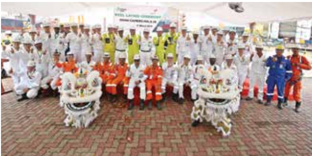
The Johan Castberg Floating Production, Storage & Offloading (FPSO) Vessel Keel-laying Ceremony took place in March 2019 at Tuas Boulevard Yard. Our partnership with project owner Equinor strengthened Sembcorp Marine's brand in Norway.