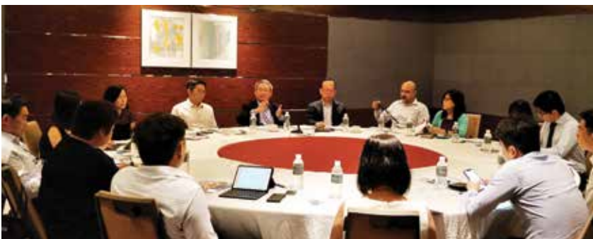
Sembcorp Marine's President & CEO sharing company updates and industry insights during a post-results investor meeting