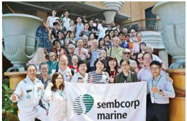
Extensive engagement with diverse stakeholders from the investment and financial communities