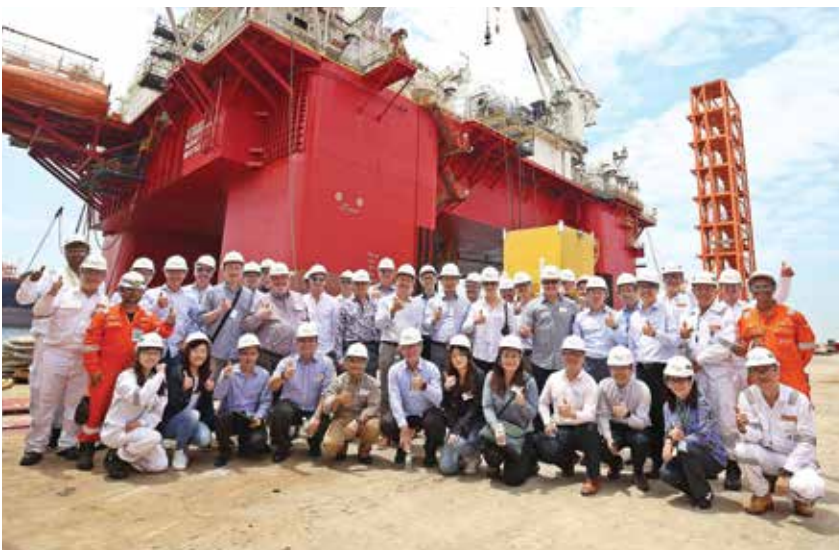
Yard visit by institutional investors as part of JP Morgan's Global Research Summit 2019 field trip

In October 2019 as part of JP Morgan's Global Research Summit field trip, Semcorp Marine hosted 40 institutional investors at TBY, showcasing our Helix Energy Q7000 semi-submersible well intervention newbuilding and the Royal Caribbean Quantum of the Seas cruise ship revitalisation project.