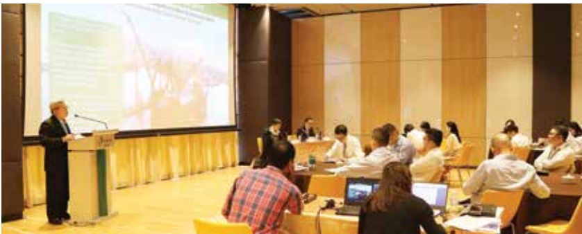
Combined analysts and media 2Q/1H2019 results briefing held for the first time at Sembcorp Marine's new corporate office at Tuas Boulevard Yard