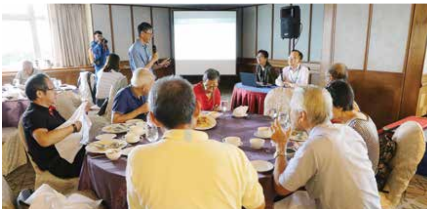
Sembcorp Marine's Management responding to queries at the company's annual outreach event for retail shareholders

For assistance, please email the Sembcorp Marine IR team at investor.relations@sembmarine.com .