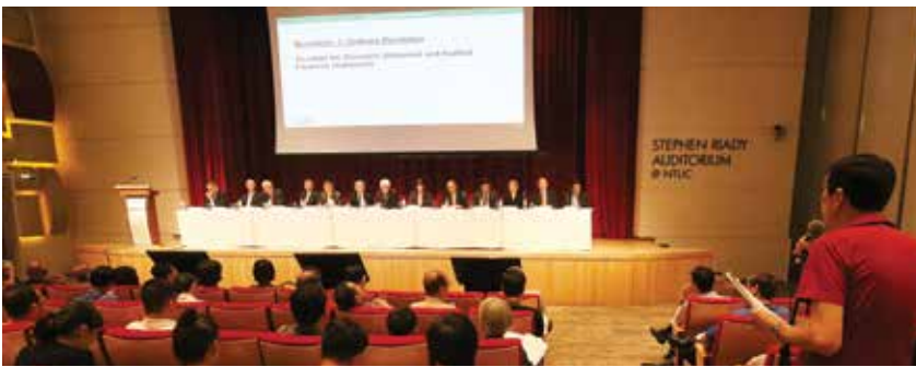
Active dialogue between shareholders and Board of Directors at Sembcorp Marine's Annual General Meeting

Sembcorp Marine upholds high standards of corporate transparency and governance in engaging the investment and financial communities. With our open dialogue and management access, we keep our diverse stakeholders regularly informed about the Group's financial performance and business activities, and the latest industry developments. We also channel stakeholder feedback to Management for strategy formulation and decision-making.