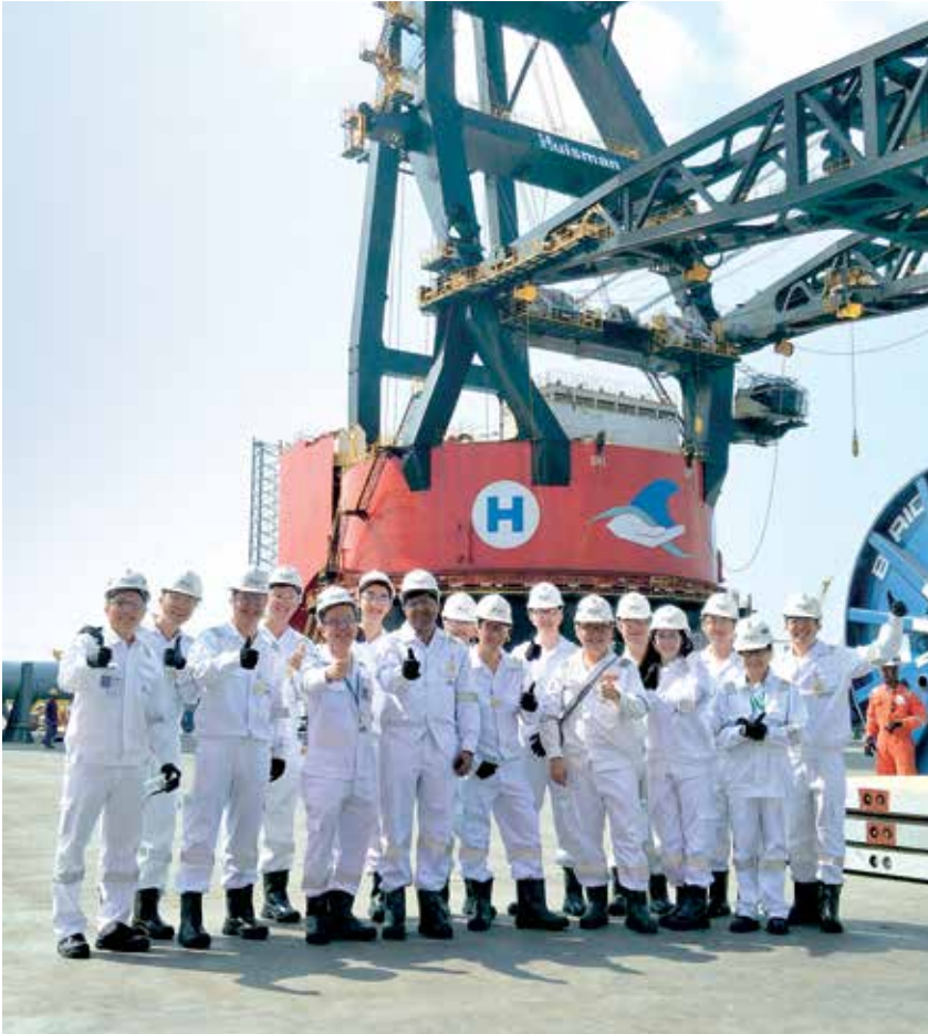
Analysts and fund managers aboard the SSCV Sleipnir