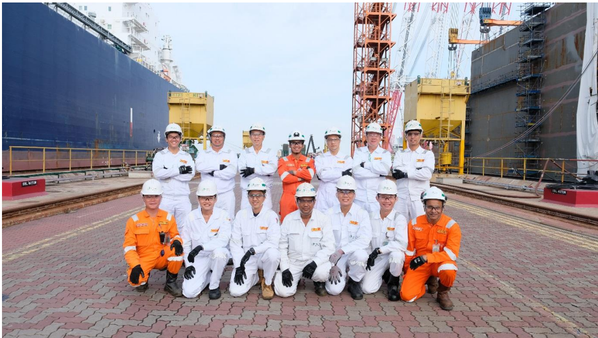
WSH Awards 2019 – Representatives of Sembcorp Marine winning teams

To download accompanying images in high-resolution jpg format, please click here .