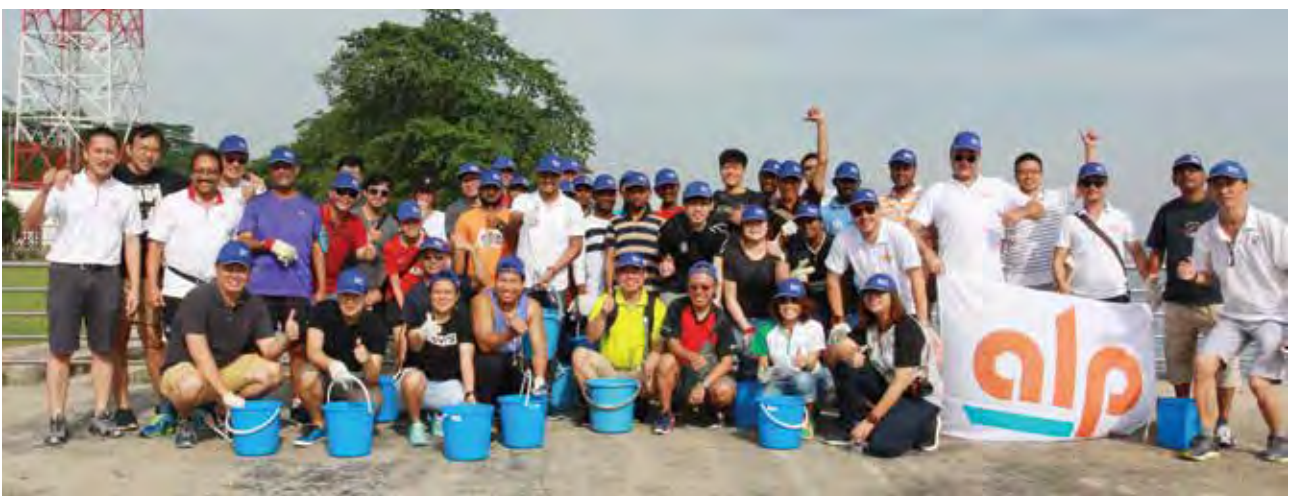
Coastal clean-up initiatives to promote environmental protection and conservation

Self-help groups such as the Chinese Development Assistance Council (CDAC), Yayasan MENDAKI, the Singapore Indian Development Association, and the Eurasian Association also benefited from direct salary contributions made by Sembcorp Marine employees.