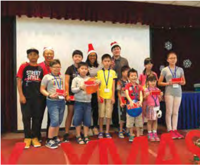
Volunteers from Sembcorp Marine bringing joy to children and youths in the community through social events and festive celebrations