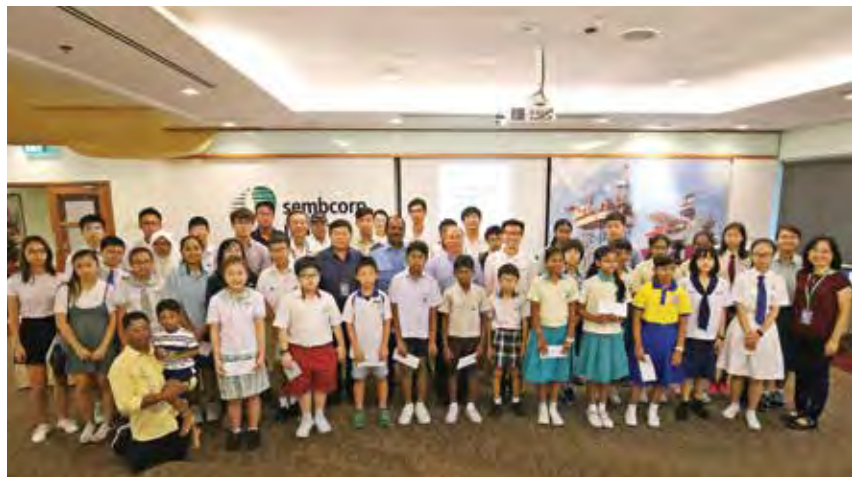
Award of bursaries to support employees' children in their education

Sembcorp Marine's School Book Assistance Grant (SchoolBAG) programme is a core part of the Group's corporate social responsibility efforts. Now in its 18 th year, the initiative is designed to support children from lower income families in their educational pursuits. In 2018, grants totalling $203,800 were awarded to 1,002 primary, secondary and junior college students from 84 schools. This brings the annual programme's cumulative contributions to more than $4.2 million since its inception in 2001.