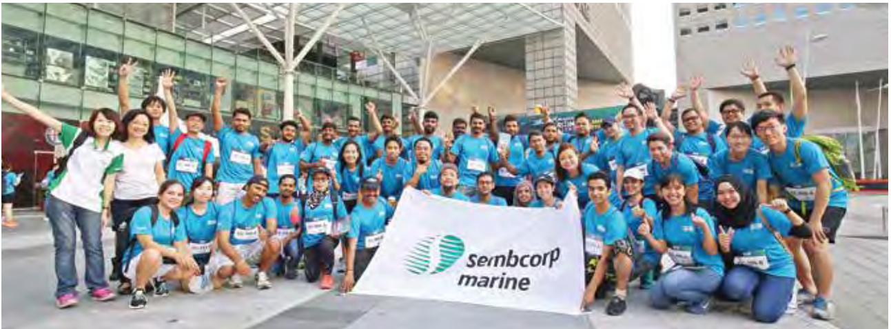
Supporting industry promotion events to promote greater awareness of Singapore's offshore and marine industry