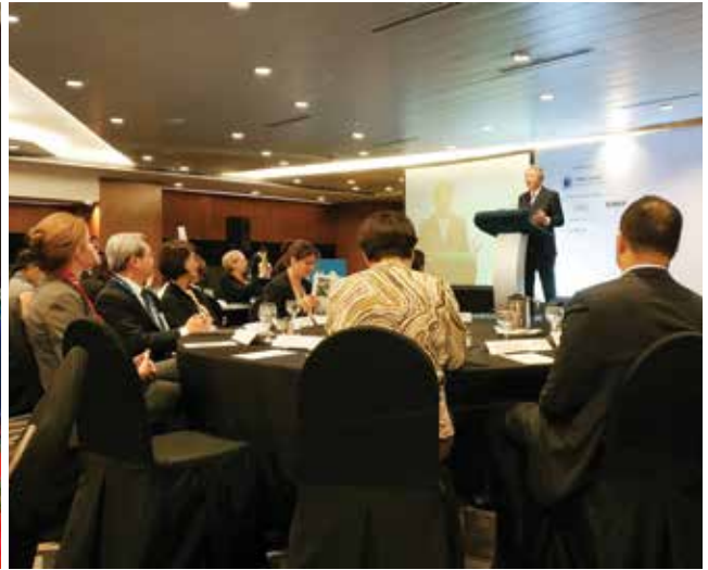
Advancing corporate social responsibility and sustainability best practices through sponsorship of the GCNS Summit 2018

The Group is a stalwart of the Community Chest's Social Help and Assistance Raised by Employees (SHARE) programme. In 2018, Sembcorp Marine and its employees jointly gave more than $67,250 to the SHARE programme. In recognition of its support, Sembcorp Marine received the Charity Silver Award at the Community Chest Awards 2018.