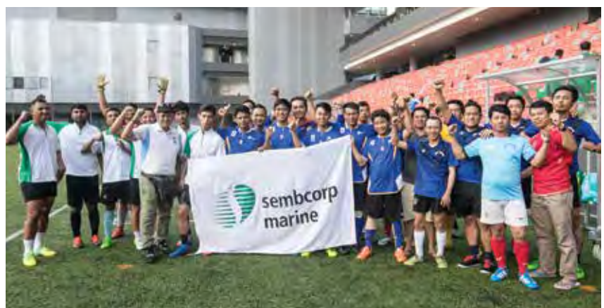
Active support and participation by Sembcorp Marine in sporting events organised by industry partners

Besides sporting events, the Group also supported various cultural programmes and arts development initiatives over the years.