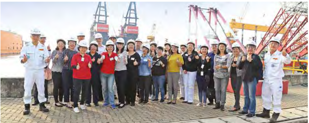
Engaging government and industry stakeholders through learning visits