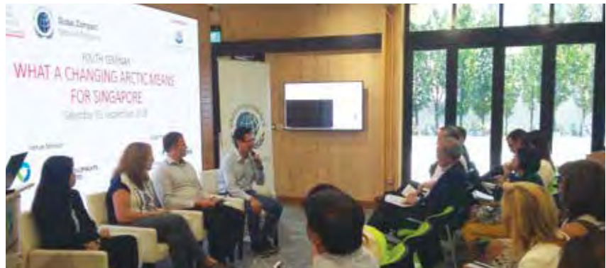
Sharing insights on Sembcorp Marine's solutions for the Arctic and green technologies at a sustainability youth seminar

Sembcorp Marine takes pride in being a member of the World Ocean Council (WOC), an international non-profit organisation committed to promoting ocean sustainable development and responsible maritime stewardship through industry partnerships and cross-sector collaborations. The Group has been a WOC member since 2015 and is active in engaging and contributing to the ocean community. In 2018, Sembcorp Marine presented its environmental sustainability programmes at the 6 th Sustainable Ocean Summit, organised by WOC in Hong Kong.