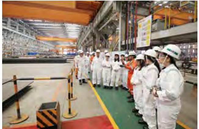
Sharing operational insights with industry partners and associates