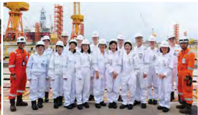
Newly launched INSIGHT programme provides opportunities for students and teaching staff to witness key project milestones in Sembcorp Marine's yards