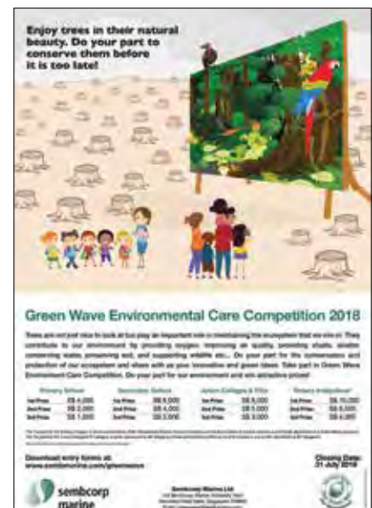
Sembcorp Marine's Green Wave Environmental Care Competition encourages students to develop creative projects for environmental sustainability