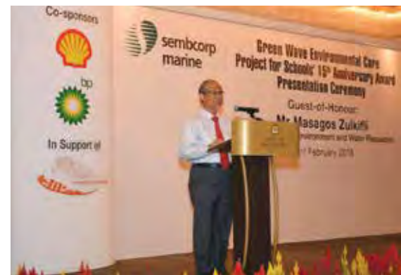
Official launch of the 2018 Green Wave Environmental Care Competition

The Green Wave Environmental Care Competition is one of Sembcorp Marine's key programmes for promoting environmental protection and sustainability among students. Organised annually since 2003, this well-regarded competition provides students with a platform to showcase their creativity in developing practical solutions for environmental issues. To reach a wider audience, the competition was expanded to include regional tertiary institutions since 2014. In 2018, Green Wave attracted 234 project entries from 843 local and regional students.