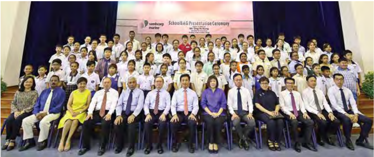
Providing financial support to students through Sembcorp Marine's SchoolBAG programme