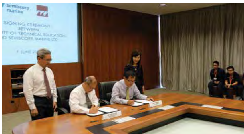
Sembcorp Marine and ITE representatives signing the terms of agreement for a new Financial Assistance Grant programme

In 2018, Sembcorp Marine, together with the Institute of Technical Education (ITE), introduced a new Financial Assistance Grant programme for students of ITE. Under the programme, ITE engineering students requiring financial support receive a monthly allowance of $600. A total of $576,000 in grants will be disbursed over two years, with 40 students expected to benefit in the first year.